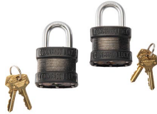
PL2 Padlock (2 pack)