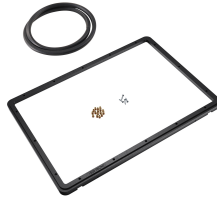
1520PF Special Application Panel Frame