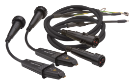
+ DH4-C probe 1.5 m leads