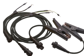
+ KC1 Kelvin clip 3 m leads