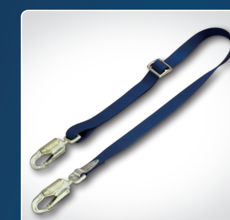
1234030 Adjustable Web Positioning Strap