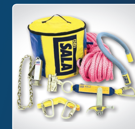
2104800 SafLok™ Pole Anchor System Meets ANSI Standards—USA